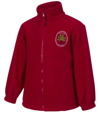
Walker Fleece With Zip Pockets £16.95