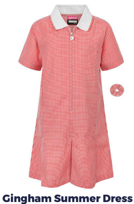
All years From £13.50