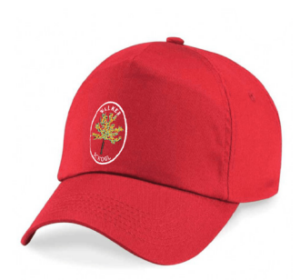
Walker Summer Cap Optional Headwear £5.95