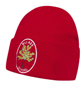
Walker Winter Hat Optional Headwear £5.95