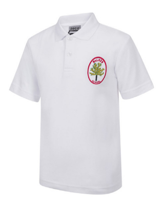
Walker Polo Shirt 65% Polyester / 35% Cotton From £7.95