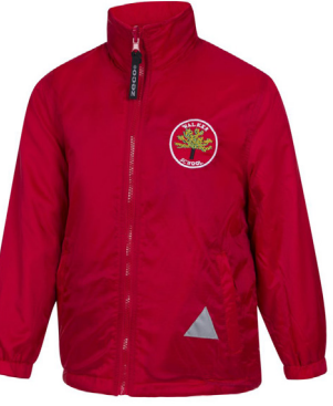
Walker Reversible Coat Concealed Hood £24.95