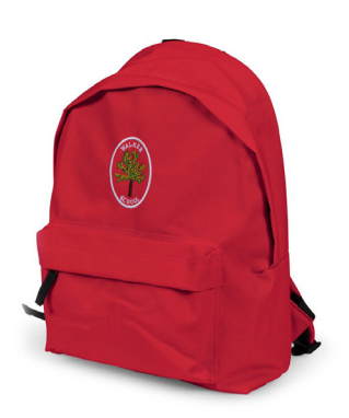
Walker Backpack Personalisable (+£4.50) £12.95