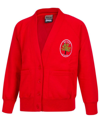
Walker Cardigan Reception - Year 6 From £13.50