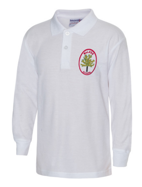
Walker Long Sleeve Polo Shirt 65% Polyester / 35% Cotton From £8.95