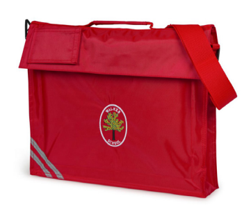
Walker Bookbag Personalisable (+£4.50) £9.95