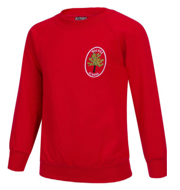
Walker Sweatshirt Reception - Year 6 From £12.50