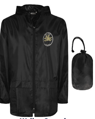
Walker Cagoule All years £13.95