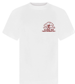
Brunswick PE T-Shirt White From £6.50