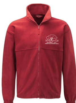
Brunswick Fleece Optional Outwear From £16.95