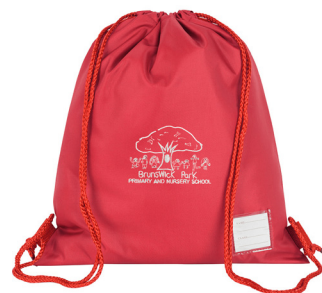
Brunswick PE Bag Drawstring Bag £6.95