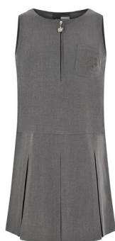
Grey Pinafore 65% Polyester/ 35% Viscose From £12.95