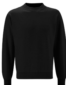
DL Black Sweatshirt Plain Black From £10.95