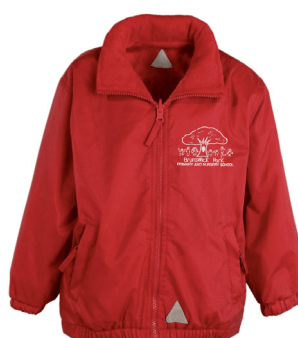
Brunswick Reversible Optional Outwear £24.95