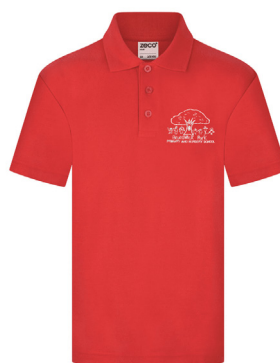
Brunswick Red Polo Easy-Iron From £8.95