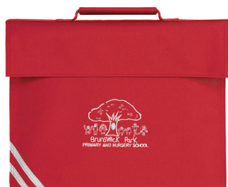
Brunswick Bookbag With Strap, Optional Accessory £9.95