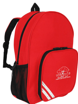
Brunswick Backpack Optional Accessory £12.95