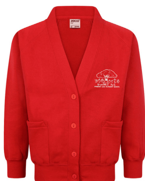
Brunswick Cardigan Reception - Year 6 From £13.50