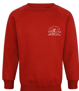
Brunswick Sweatshirt Reception - Year 6 From £12.50