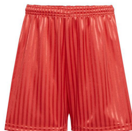
Red Shadow Stripe Shorts Made from Recycled Material From £4.50