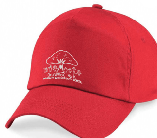
Brunswick Cap Optional Headwear £5.95