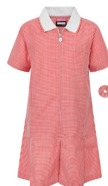
Gingham Summer Dress With Matching Scrunchie From £13.50