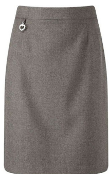
Grey Skirt 65% Polyester/ 35% Viscose- From £12.95