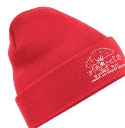
Brunswick Winter Hat Optional Headwear £5.95