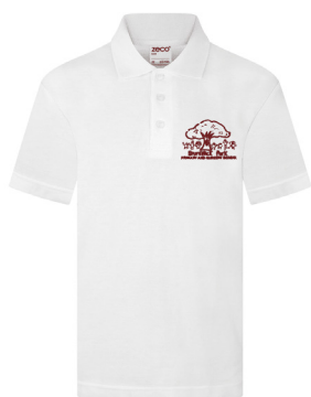
Brunswick White Polo Easy-Iron From £7.95

Stationery and name labels also available in- store and online