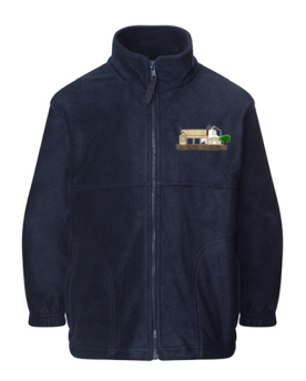
Ponsbourne Fleece Also Available Plain £16.95