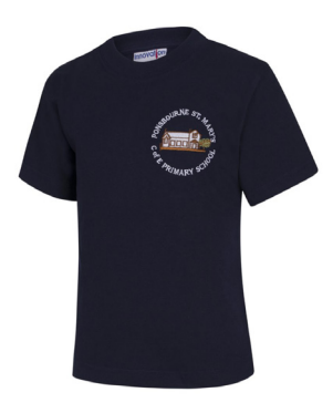
Ponsbourne PE T-Shirt From £7.95