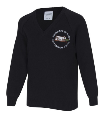
Ponsbourne V-Neck Jumper From £17.95